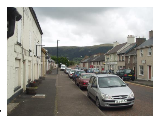
and "Traffic management"

were the most important things to the people who attended the meetings.