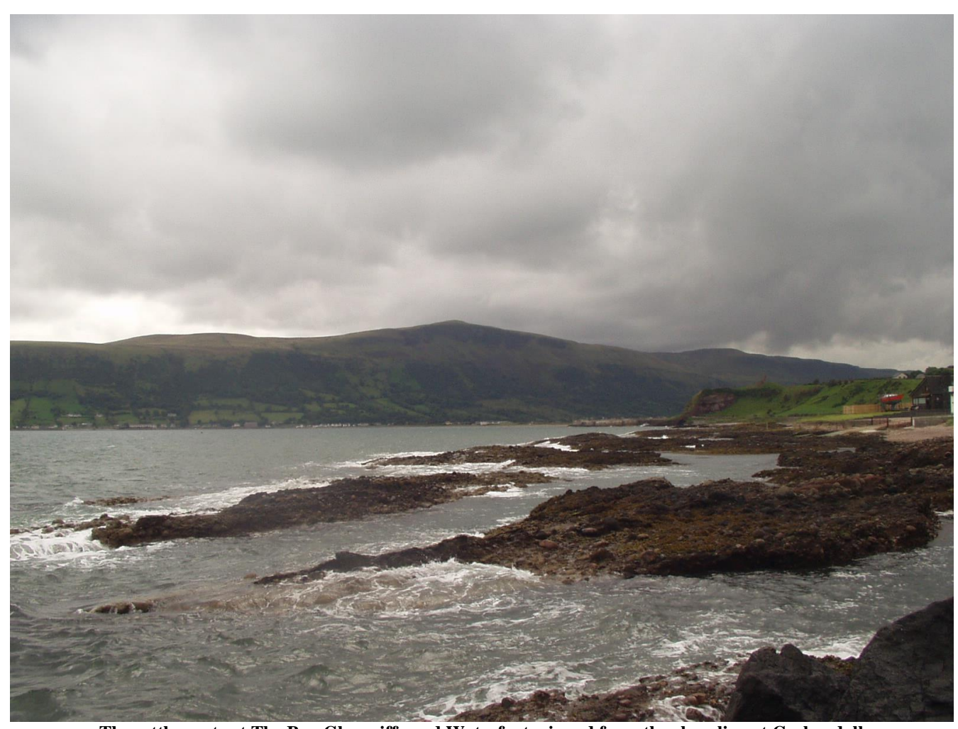
The settlements at The Bay Glenariffe and Waterfoot, viewed from the shoreline at Cushendall