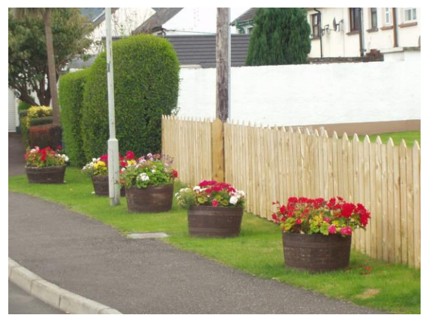
The floral displays are visible on entering Waterfoot from The Bay Glenariffe

A very positive local initiative was successfully implemented when donations were made from households to help volunteers to tidy the area; the SPREAD group helped last year. This work stopped for a time but volunteers were willing to restart the scheme which was active again in 2007. Some insurance issues may need to be resolved.